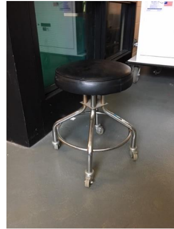
ADJUSTABLE HEIGHT MOBILE EXAM STOOL