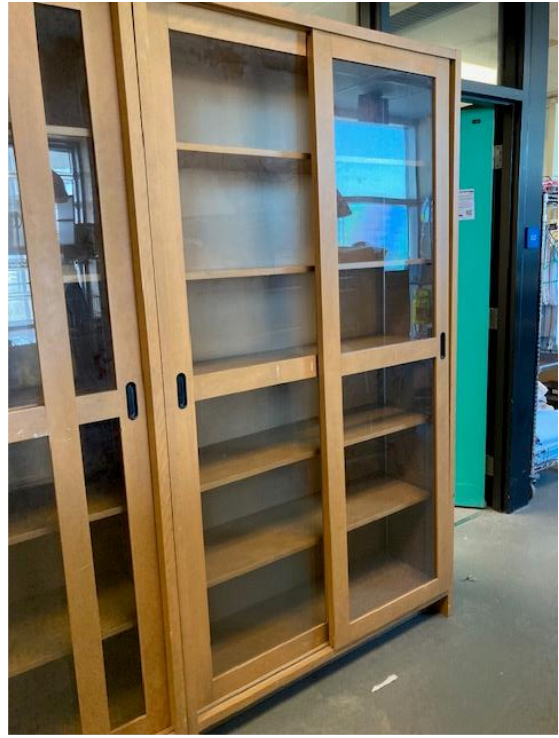
Cabinet A (2)