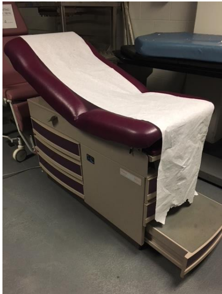
ADJUSTABLE EXAM TABLE