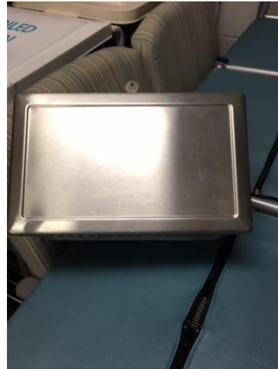
WALL MOUNTED STAINLESS STEEL PAPER TOWEL DISPENSER