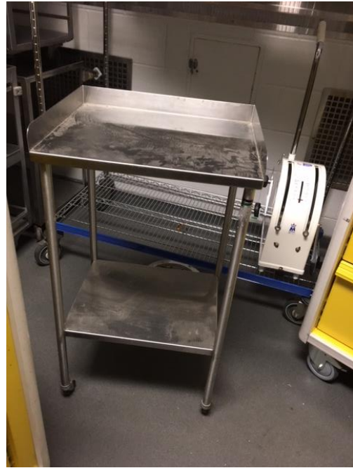
EXAM ROOM EQUIPMENT TABLE 2