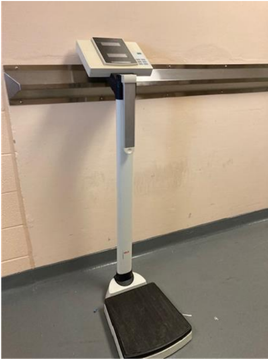
Patient Scale B