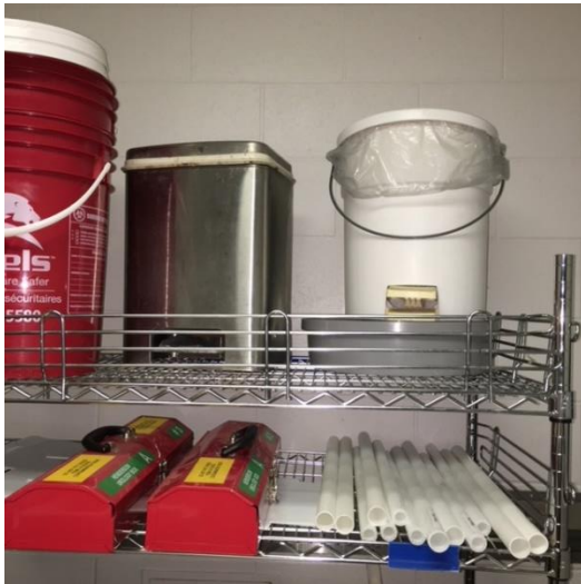
STAINLESS STEEL GARBAGE CAN