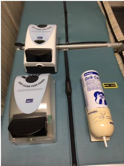
WALL MOUNTED HAND SANITIZERS