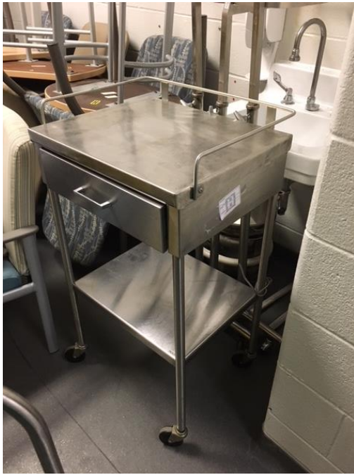
EXAM ROOM EQUIPMENT TABLE 1