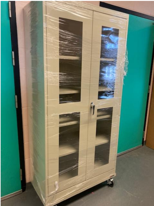
Cabinet B (2)