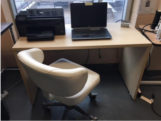
DR.'S EXAM ROOM DESK AND CHAIR