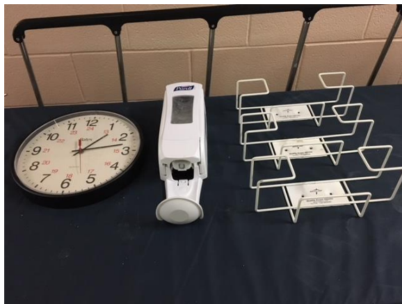
CLOCK, WALL MOUNT HAND CLEANER WALL MOUNTED EXAM GLOVE BOX HOLDER