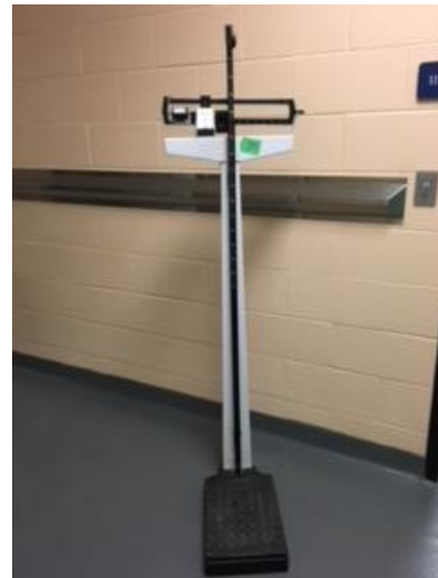
PATIENT SCALE A