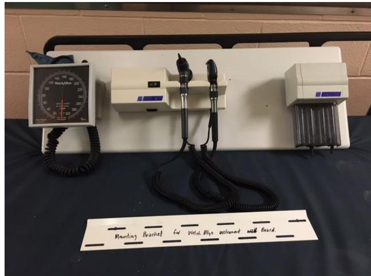
WALL MOUNTED BLOOD PRESSURE, Welch Allyn Otoscope Ophthalmoscope Integrated Wall Mount Diagnostic System