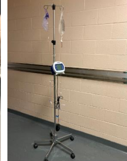
I.V. / feeding pump