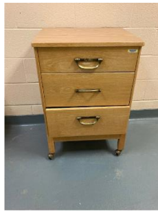
bed side table 1