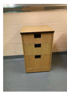
bed side table 3