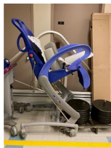
mobile shower chair