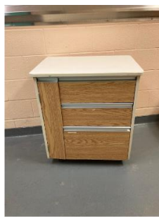
bed side table 2