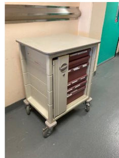
small bed side cart