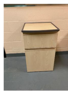
bed side table 4