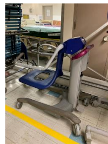
mobile tub chair