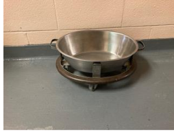
SS Floor basin