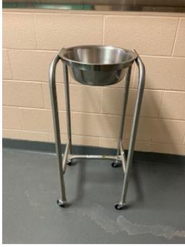
SS Bowl stand