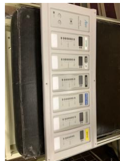
Gas panel alarm