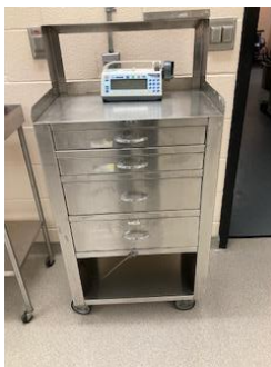
SS drawer carts