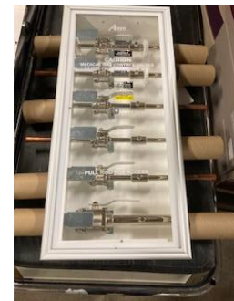
Gas Panel Shut-off