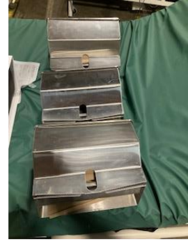
SS paper towel